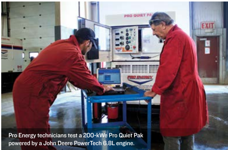
Pro Energy technicians test a 200-kW Pro Quiet Pak powered by a John Deere PowerTech 6.8L engine.