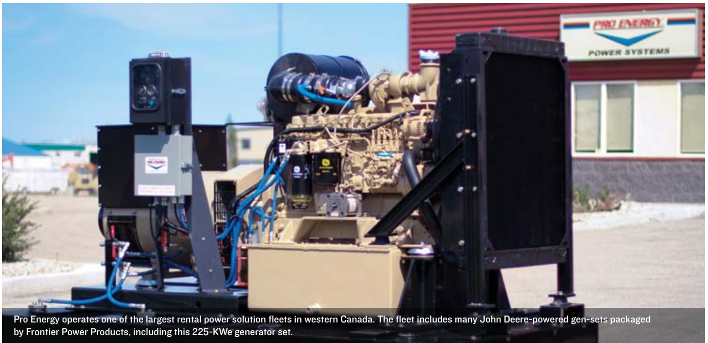
Pro Energy operates one of the largest rental power solution fleets in western Canada. The fleet includes many John Deere-powered gen-sets packaged by Frontier Power Products, including this 225-kW generator set.