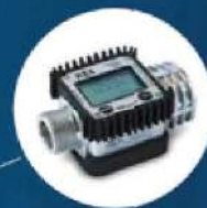
DIGITAL FLOW METERS