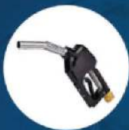
DISPENSING NOZZLE VARIATIONS

The range has an extra large equipment compartment area that can house a variety of accessories.