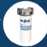
IN LINE PARTIAL SEPARATION FILTERS