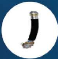
HOSES WITH ISO QUICK RELEASE COUPLERS