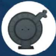
UP TO 10M OR 32FT RETRACTABLE HOSE REELS