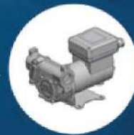
ENGINE DRIVEN OR ELECTRIC PUMPS